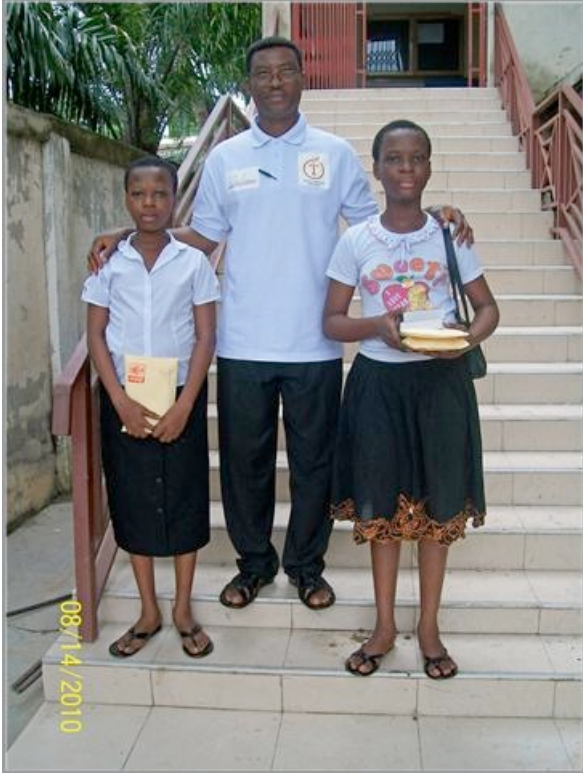
This Father brought his daughters to be taught the Gospel