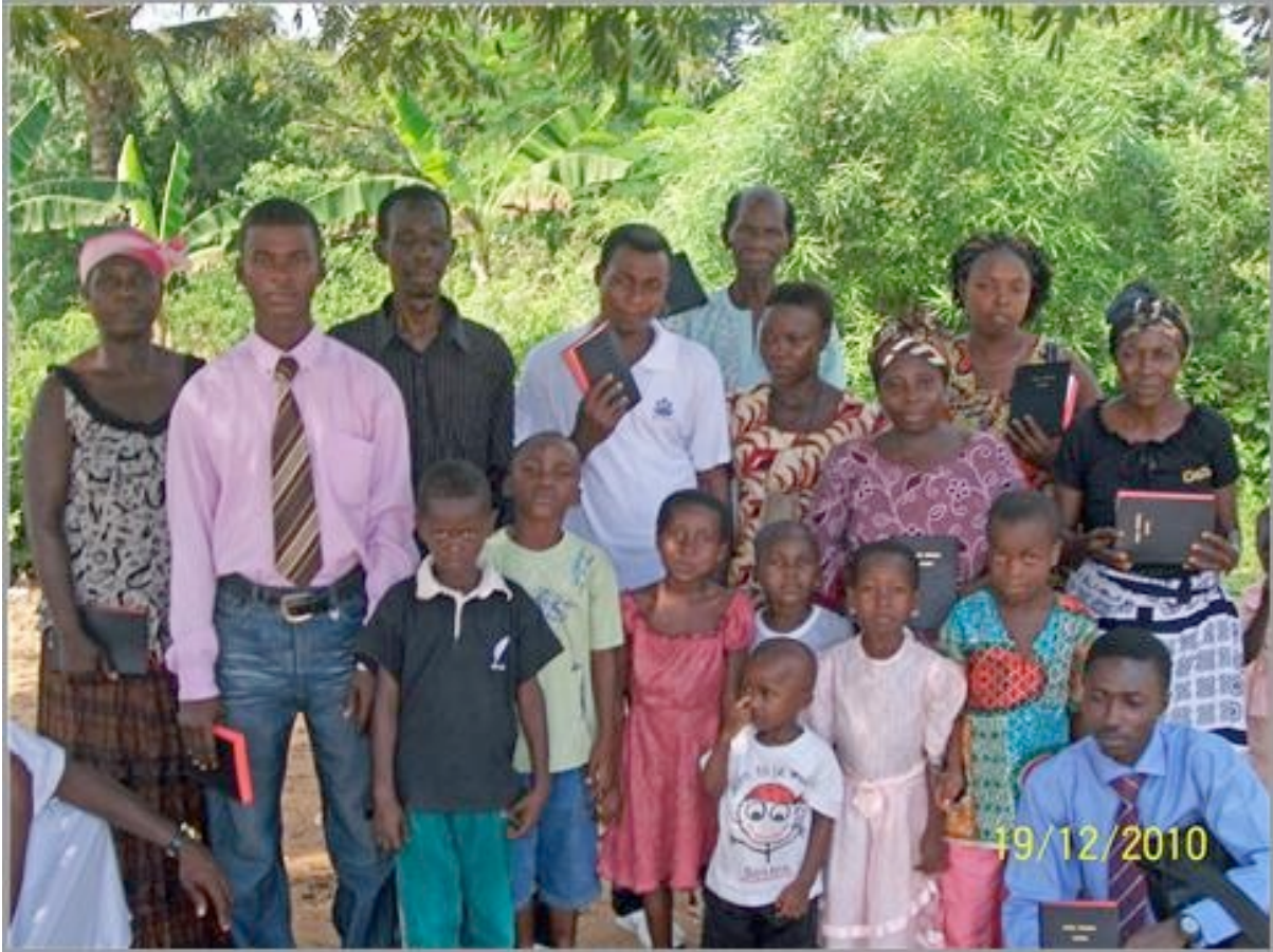
Church members with new Bibles