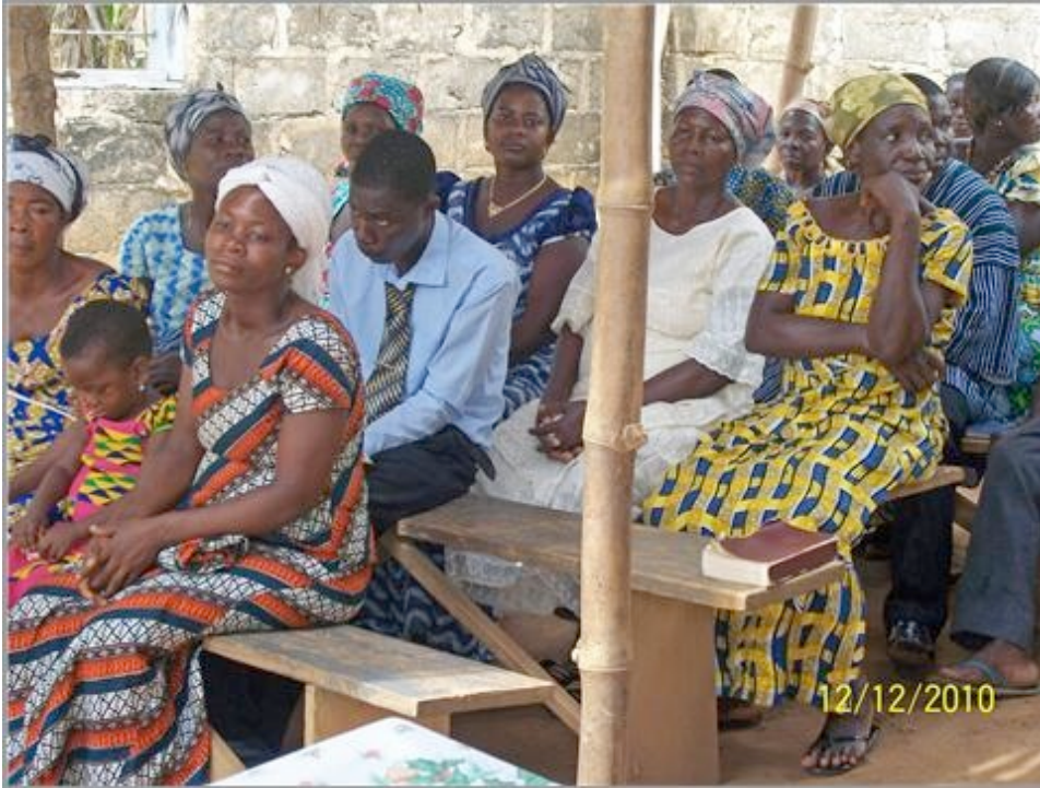
Church assembly at Bereku - ready for a Bible Lesson