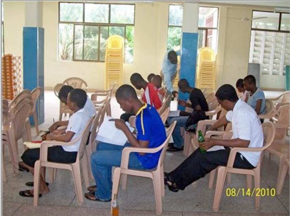
Students attending a Bible Class